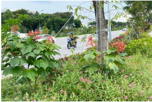
A road verge in Singapore's Tampines town where selective cutting promoted abundant flowering and allowed plants to grow at different heights.

The greenery surrounding the verges has a positive impact on butterflies, suggesting that road verges can act as corridors linking the insects to other green spaces.