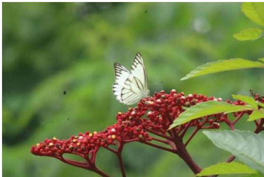
A Striped Albatross butterfly ( Appias libythea ) feeding on nectar from a Red Leea ( Leea rubra ) within a road verge in Singapore's Jurong town. Red Leeas are commonly planted in verges and native to the country. Credit: NTU Singapore

The greenery surrounding the verges has a positive impact on butterflies, suggesting that road verges can act as corridors linking the insects to other green spaces.